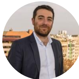
Investment Director Asabys Partners