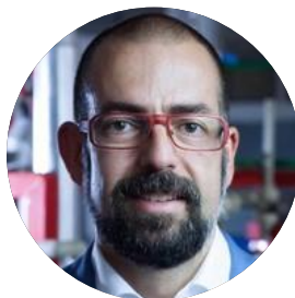
Director IQS Tech Factory