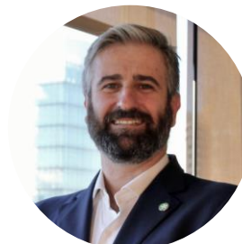
Co-founder & Partner Doctoralia