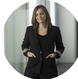
Co-founder & CEO Glycardial Diagnostics