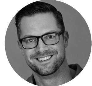
Co-founder & CEO Mowoot