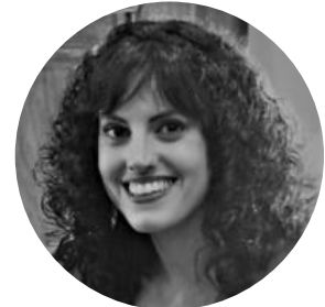
Co-founder & CTO MIWEndo Solutions