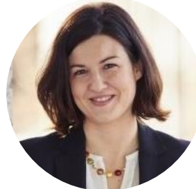
European Patent Attorney & Hoffmann Eitle Associate