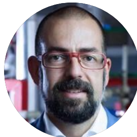
Director IQS Tech Factory