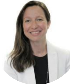
Partner Director Paocapital