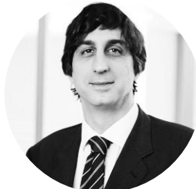
European and Spanish Patent Attorney Hoffmann Eitle