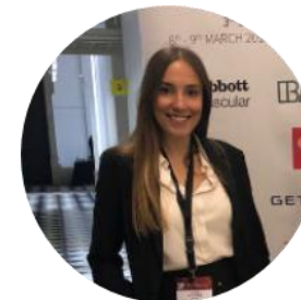
Co-founder & CTO Aortyx