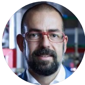
Director IQS Tech Factory