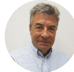
Partner Swan Medical