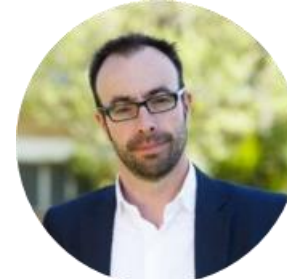
CEO Rob Surgical & President CataloniaBlo & HealthTech