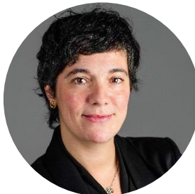
Associate Director Asphalion