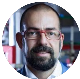
Director IQS Tech Factory