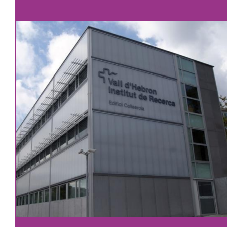
The Vall d'Hebron Research Institute (VHIR) is a public sector institution that promotes and develops the research, innovationand biosanitary teaching of the Vall d'Hebron University Hospital. Through the excellence of our research, we identify and apply new solutions to the health problems of society and we contribute to spread them aroundthe world.